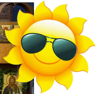
Vacation Church School 2019