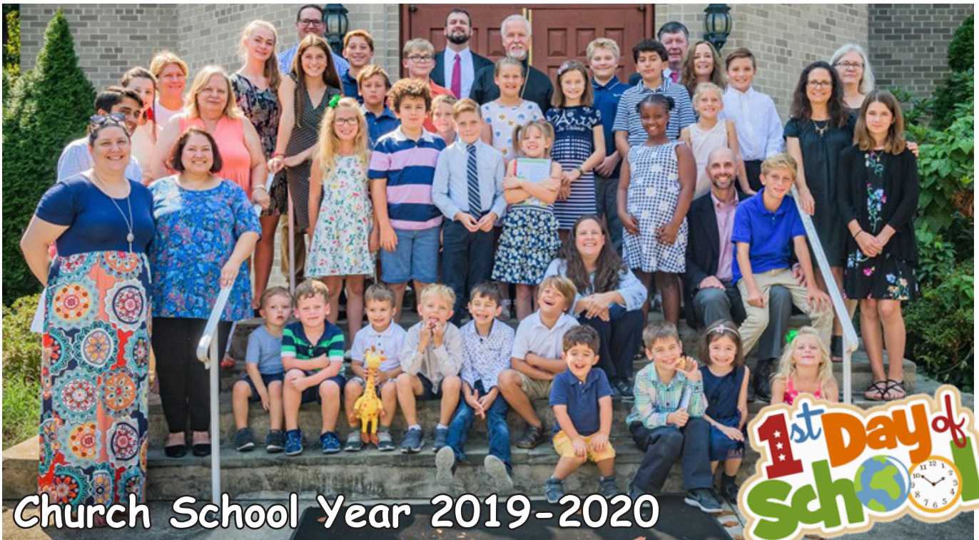
Church School Year 2019-2020